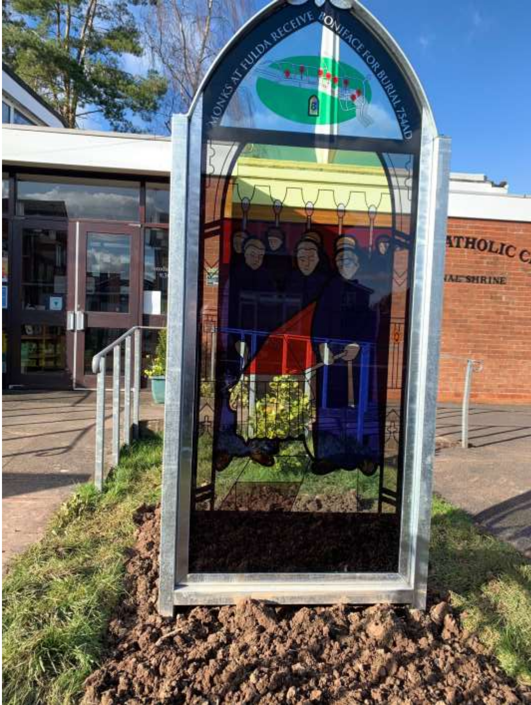
Roman Catholic Church