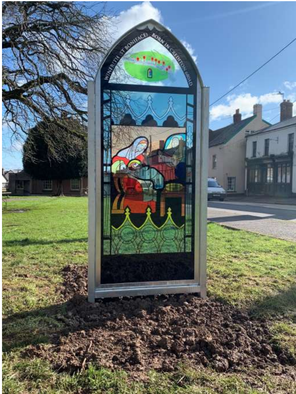
St Lawrence Green