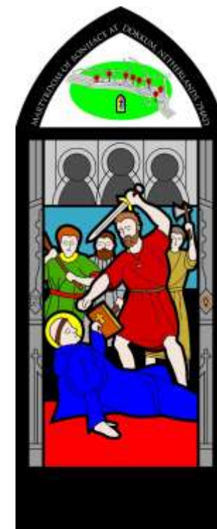
Words MARTYRDOM OF BONIFACE AT DOKKUM, NETHERLANDS, 754 AD