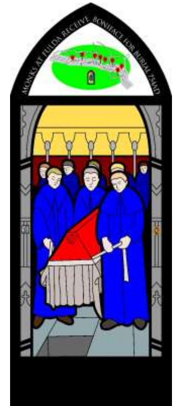
Words MONKS AT FULDA RECEIVE BONIFACE FOR BURIAL, 754 AD