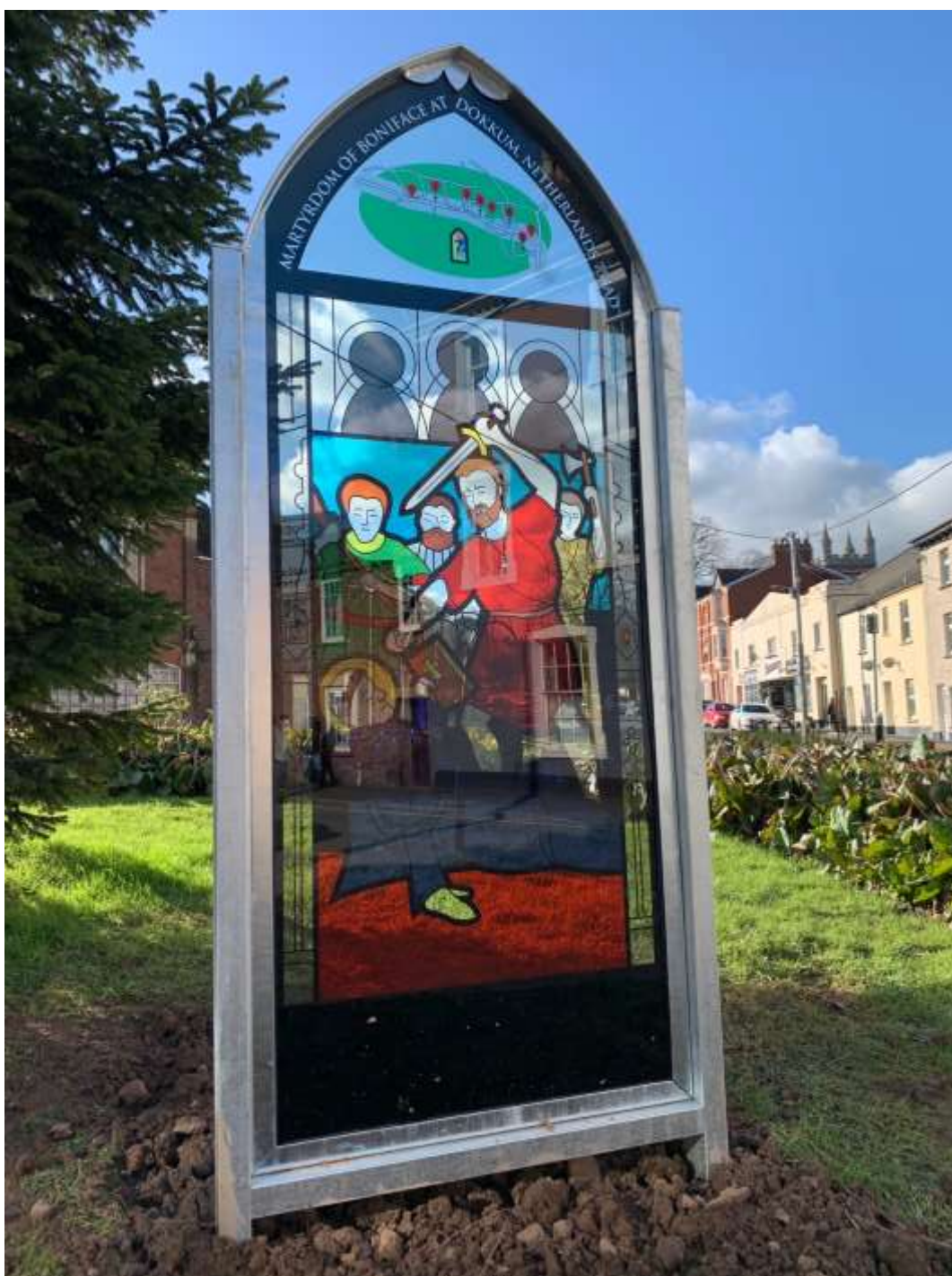
East Street junction