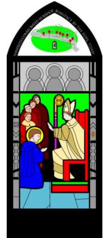
Words WINFRITH CONSECrated AS BISHOP BONIFACE BY THE POPE 722 AD