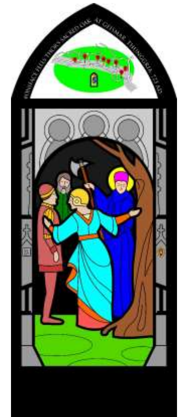
Words BONIFACE FELLS THOR'S SACRED OAK TREE AT GEISMAR, THUNGRIA, 723 AD