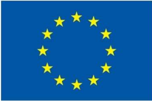
The European Agricultural Fund for Rural Development: Europe investing in rural areas